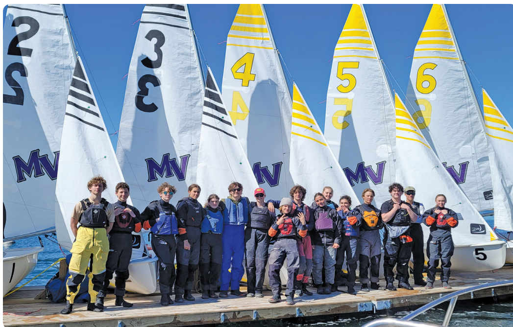
The Martha's Vineyard Regional High School varsity sailing team, coached by Sail MV, finished their Spring 2024 season as the top public school in Massachusetts.