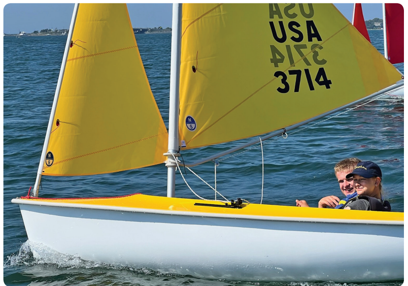
Out for a ride on one of Sail MV's new adaptive sailboats, the Hansa 303.

the paperwork straight for the volunteers who didn't have time in their life to do it otherwise," Rick Brew recalls. "She was dedicated to keeping it all manageable."