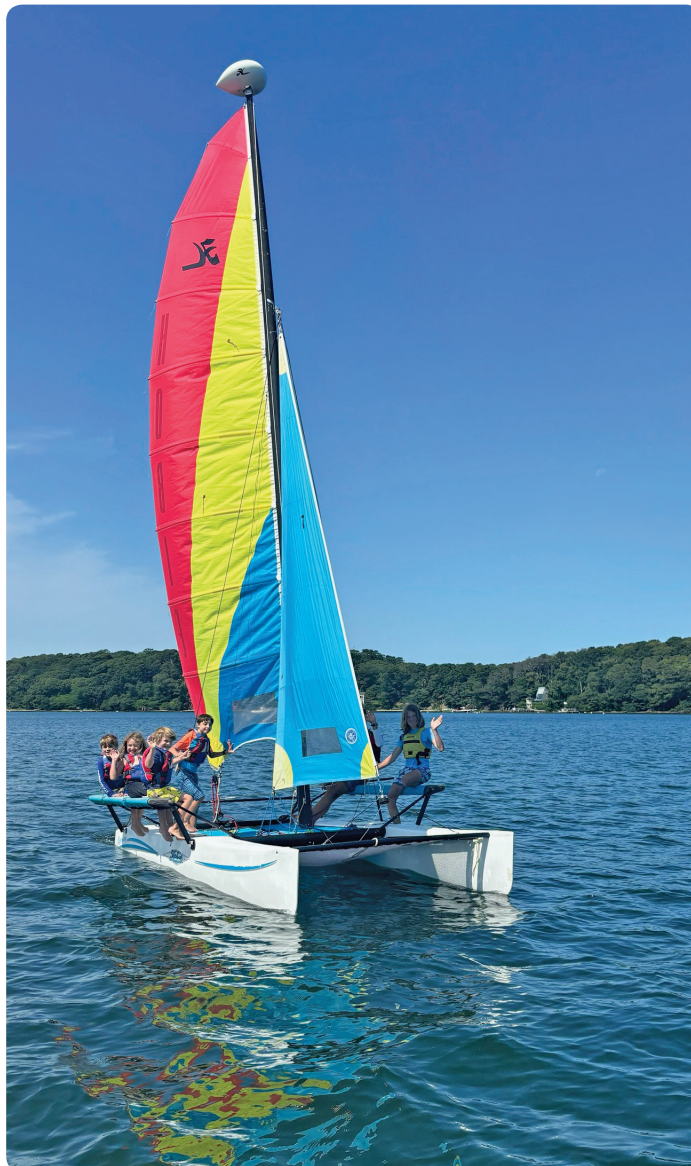
A group of students in Messing Around in Boats, sailing out together.