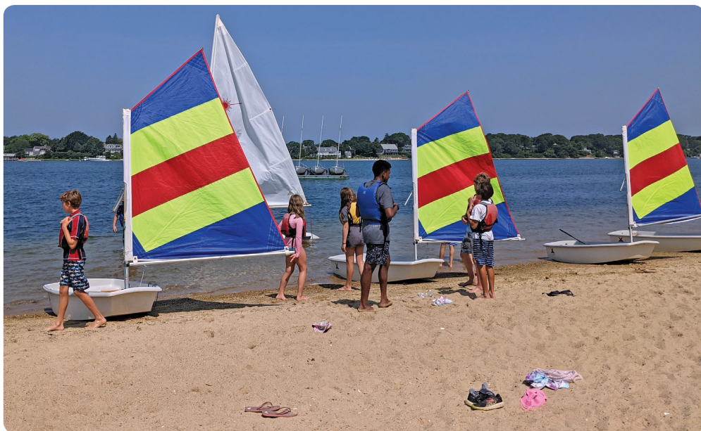
Sail MV’s signature eight-week instructional program on the Lagoon was back this summer.