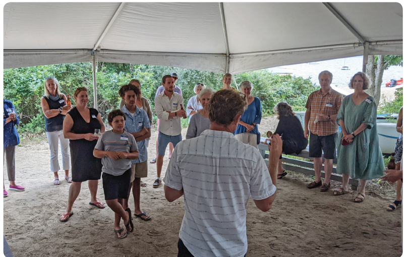
Sail MV hosted two modest gatherings at the Sailing Camp boathouse in the summer of 2021. Plans are being made now for more in-person celebrations in the year ahead.