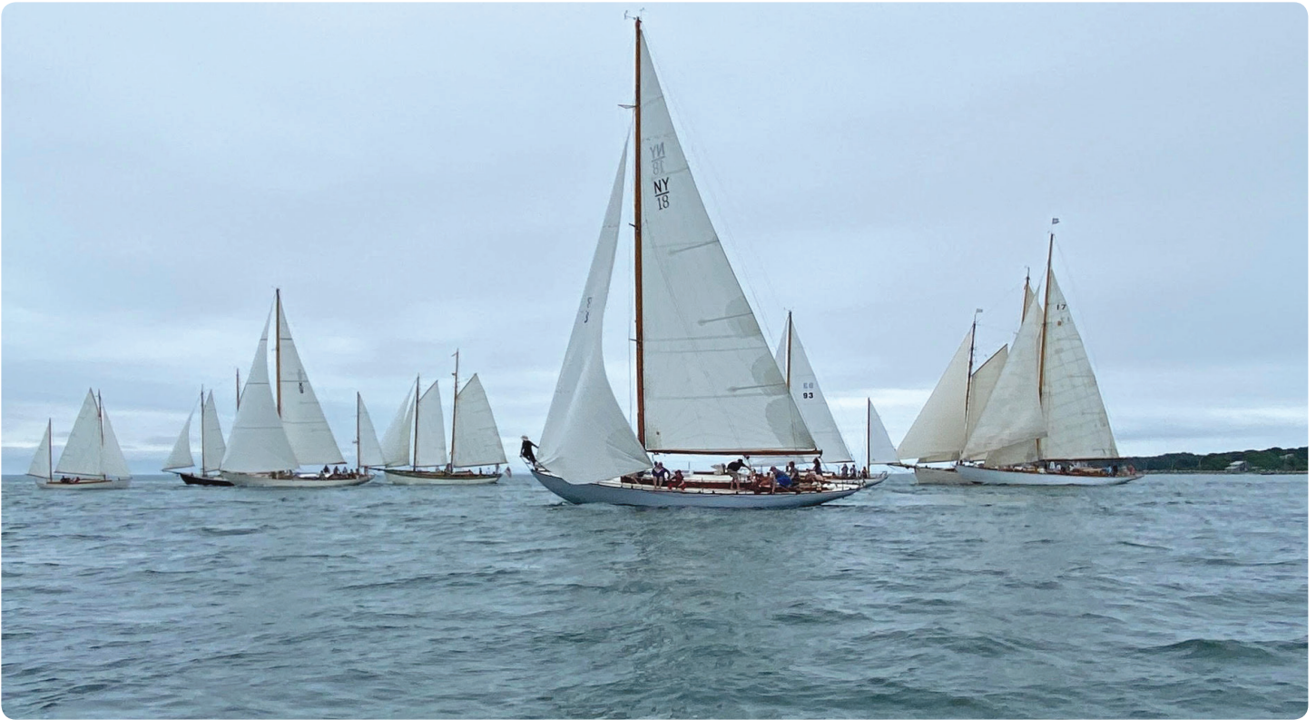
Classic sailing craft gathered in July for the 15th annual Vineyard Cup Regatta.

A FTER WE ALL shared a very difficult pandemic year in 2020, Sail MV entered 2021 cautiously and with many questions yet to be answered. However, we finished 2020 in a good financial position, thanks to strong support from many individual and business donors supplemented by government aid programs. Measures put in place since 2019 meant we were able to run a lean and efficient ship with minimal crew and expense.