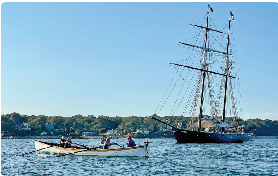
Rowers enjoy a September outing in Vineyard Haven harbor on the pilot gig Grace.

Looking ahead, he says: “Our virtual events were great successes for fund-raising last year and again this year. But now we’re thinking about how we can begin reconnecting with people in person. The open houses were small events held under a tent with lots of fresh air – just sixty or